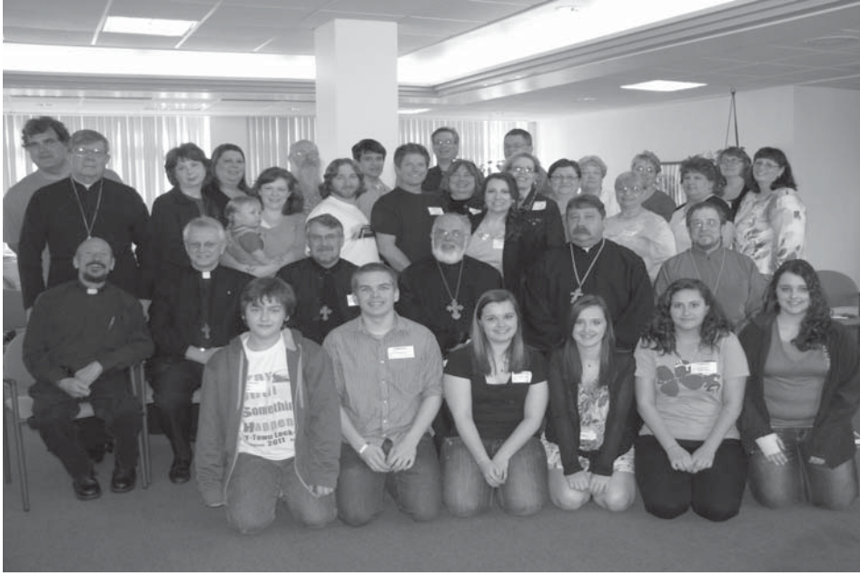
Sharing our Faith at the Annual UOL Lenten Retreat in Villa Maria, PA