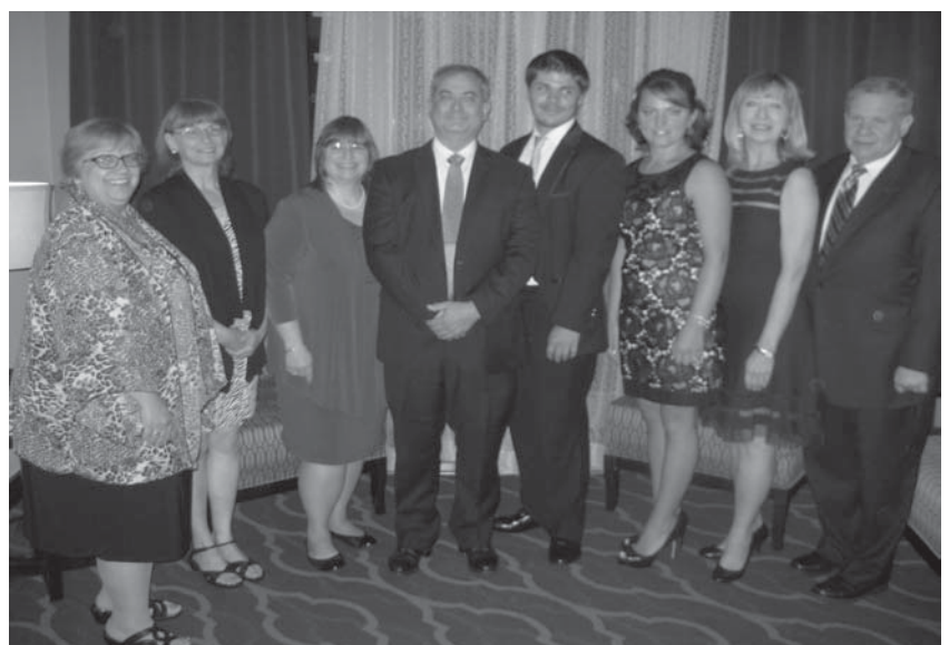
National Executive Board Senior UOL 2015-2016