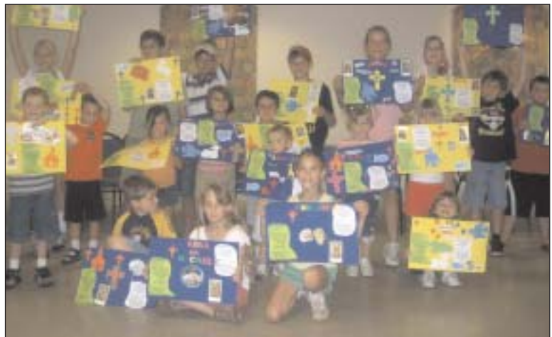
Camp participants display art work they completed during the camp.

After lunch on the beautiful grounds overlooking a lake, some of the older students and adults also went to the cemetery, while the younger students enjoyed the playground.