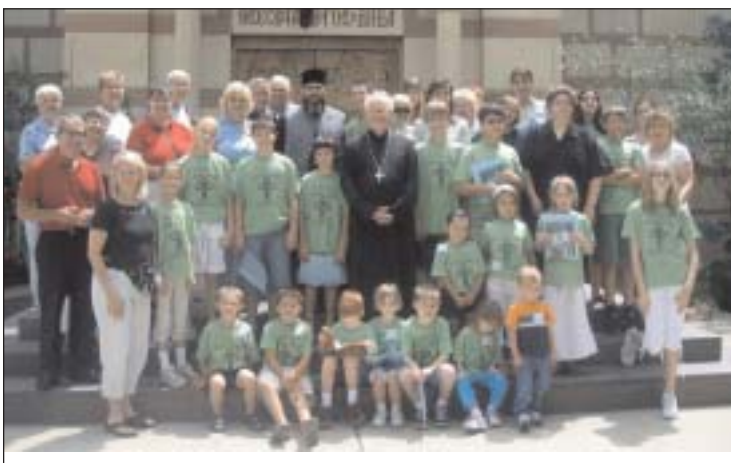
Participants, in their green camp t-shirts, as well as the adult and student leaders made this second annual event a huge success.