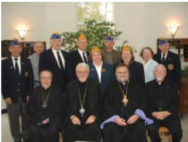
Members of the National Monument Committee of the Ukrainian American Veterans. ×éáí è éí ï ðáó ïí áóáí áí ï àì 'yóí èèà ï ðááí çàó; Óèðà;í ñúèè Áí àðèèáí ñúèè Ááááðáí 'á.

The Ukrainian American Veterans Monument Committee expects to begin its fundraising efforts for the monument this summer.